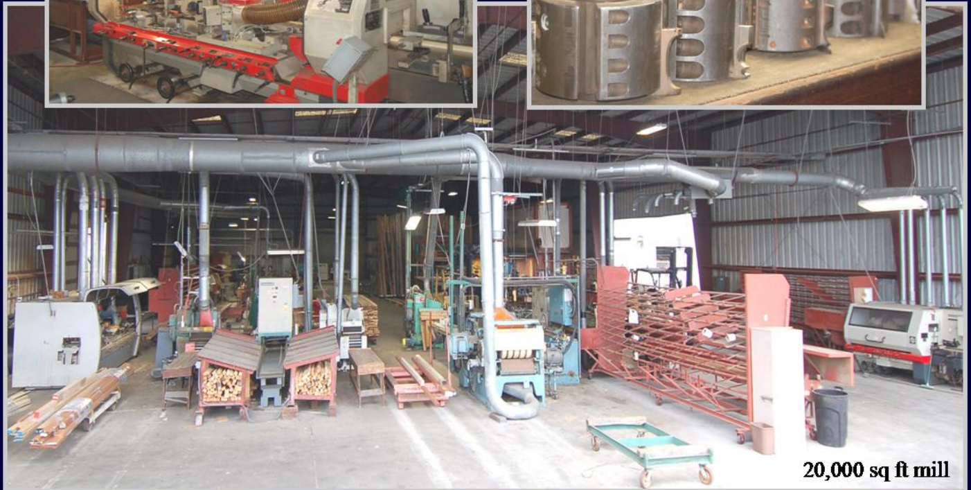
20,000 sq ft mill